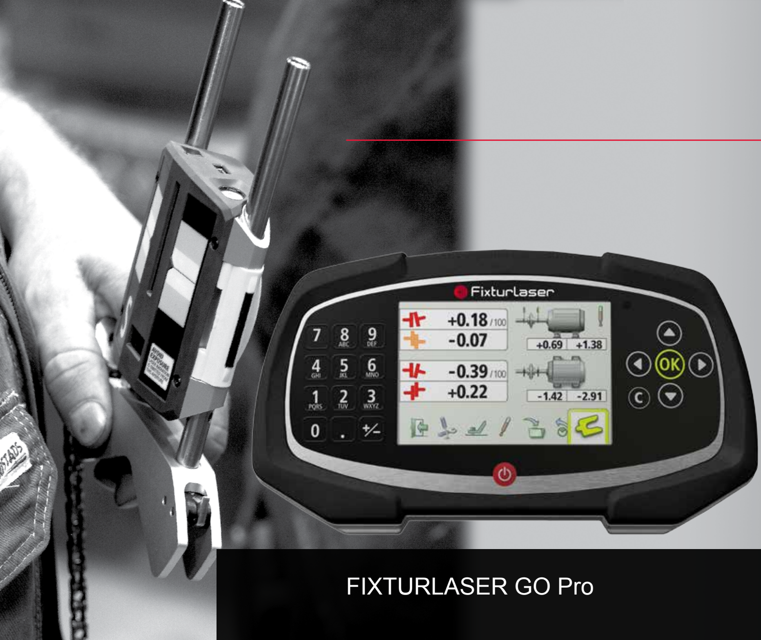
FIXTURLASER GO Pro